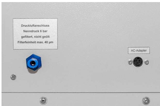
Rear panel of device with supply connections